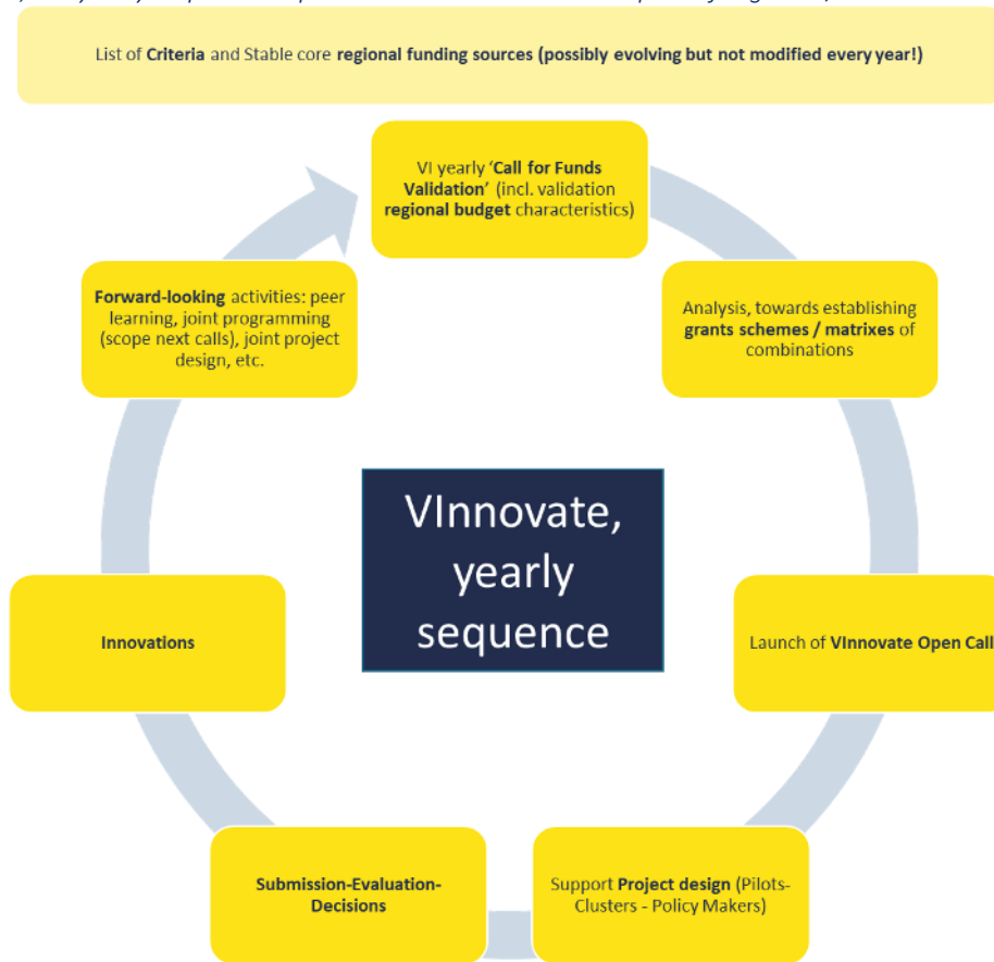
Figure 3: Vinnovate, the yearly sequence implemented based on a stable pool of regional / national instruments

Relying upon intense co-creation with the core regions, a list of key criteria has been established. We provide below an incomplete overview of some of these criteria, which help in understanding the conceptual framework in which Vinnovate would actually operate.